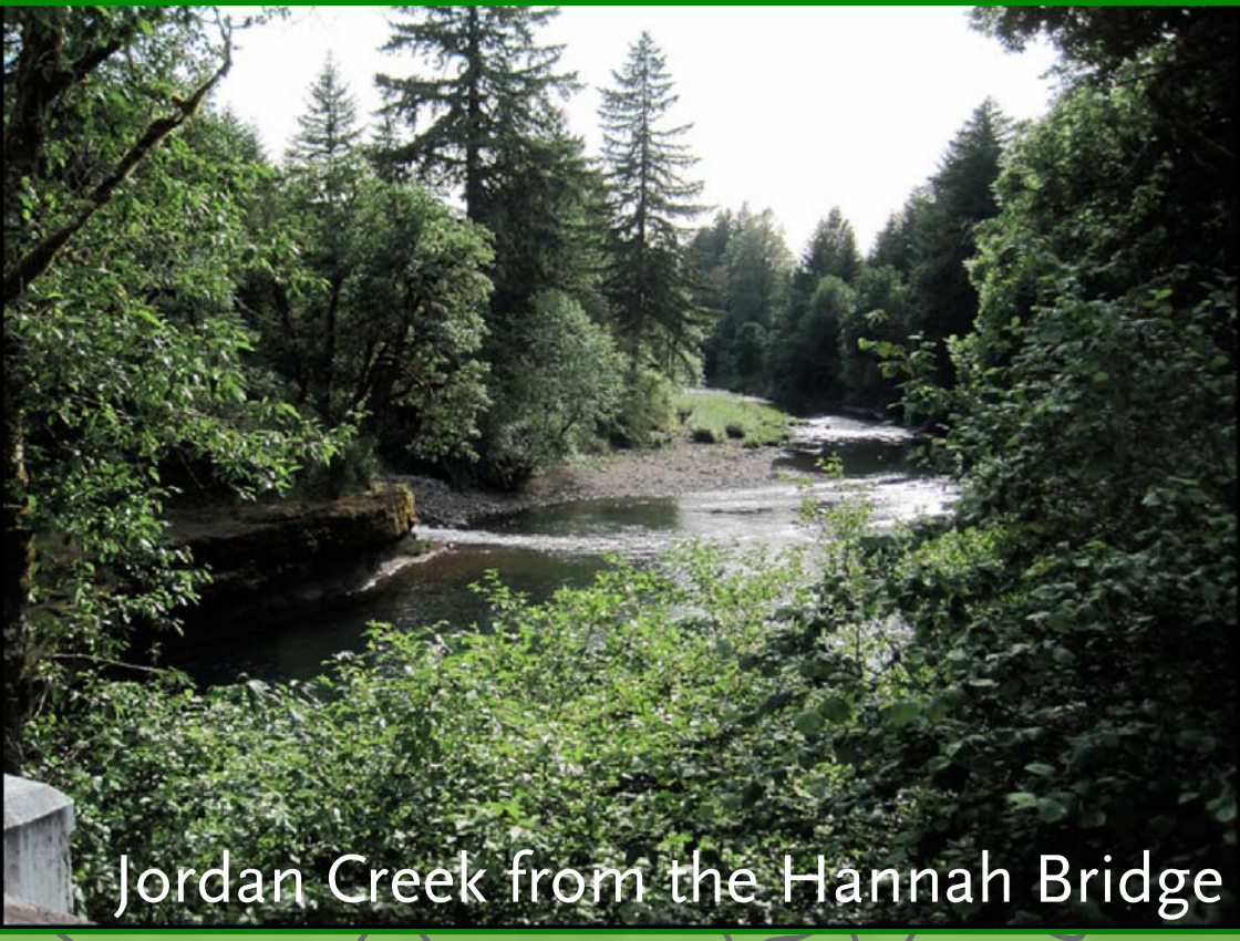
Jordan Creek from the Hannah Bridge